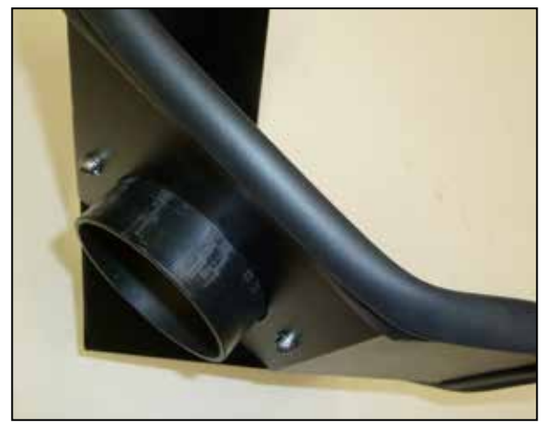
8. Install the filter adapter into the heat shield and secure with the provided hardware.