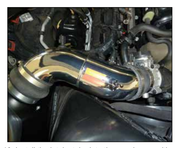
16. Install the intake tube into the couplers, position for best fit and then secure with the provided hose clamps.