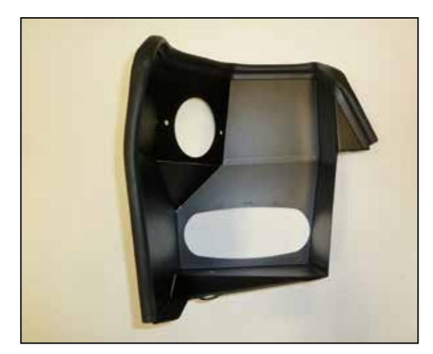
7. Install the provided edge trim onto the K&N heat shield as shown.