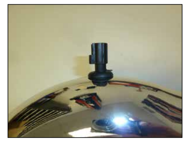
15. Remove the IAT sensor from the factory intake tube and then remove the O-Ring from the sensor. Using the provided grommet, install the sensor into the K&N intake tube as shown. NOTE: The IAT sensor is very fragile, use caution while handling the sensor so as not to damage it.