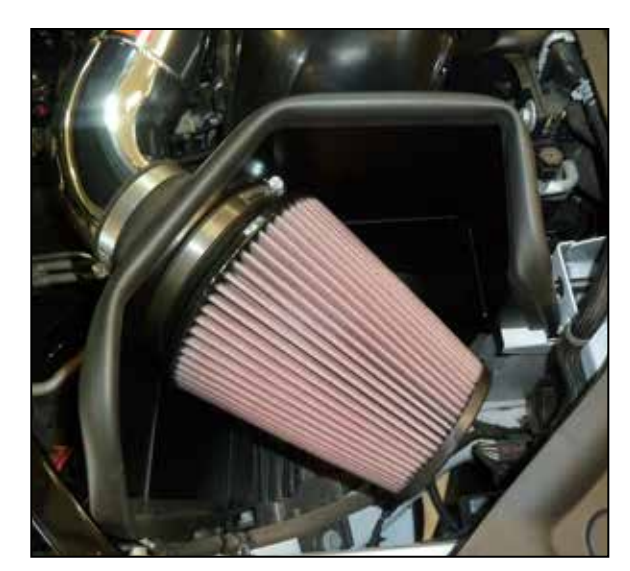
20. Install the K&N air filter and secure with the provided hose clamp.