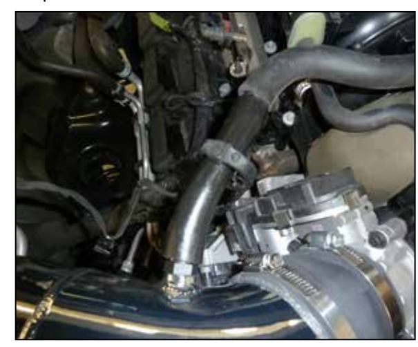
17. Remove the short section of the factory CCV hose and install the straight section provided. Connect the CCV hose to the fitting installed into the K&N intake tube.