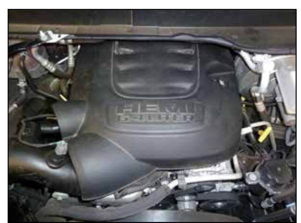
2. Lift off the decorative engine cover and set aside.

NOTE: Disconnecting the negative battery cable erases pre-programmed electronic memories. Write down all memory settings before disconnecting the negative battery cable. Some radios will require an anti-theft code to be entered after the battery is reconnected. The anti-theft code is typically supplied with your owner's manual. In the event your vehicles anti-theft code cannot be recovered, contact an authorized dealership to obtain your vehicles anti-theft code.