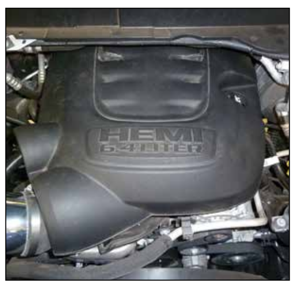
19. Reinstall the engine cover.