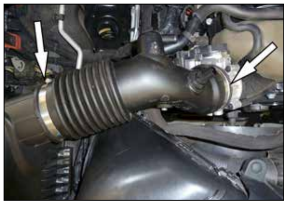
4. Loosen the hose clamps that secure the factory intake tube and then remove the intake tube from the vehicle.