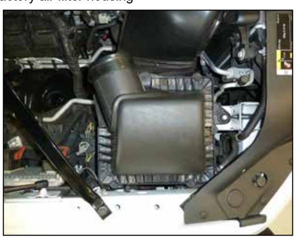
6. Pull the factory air filter housing straight up and remove it from the vehicle. NOTE: K&N Engineering, Inc., recommends that customers do not discard factory air intake.