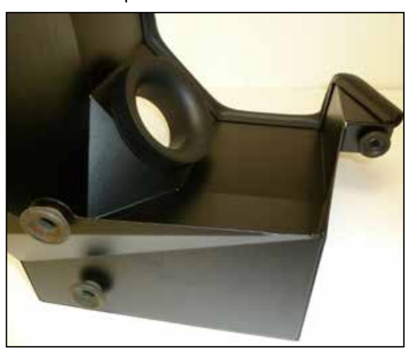
9. Remove the three mounting grommets from the factory air filter housing and install them into the K&N heat shield as shown.