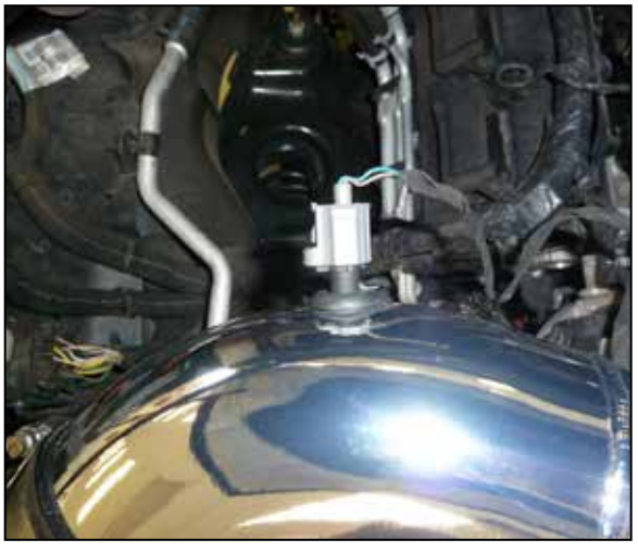
18. Reconnect the IAT sensor electrical connection.