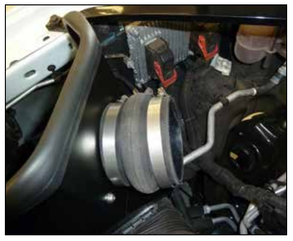
12. Install the provided hump coupler onto the filter adapter and secure with the provided hose clamp.