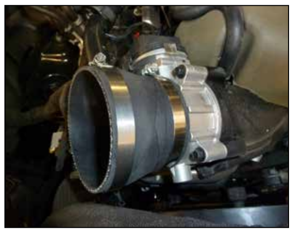
13. Install the step coupler onto the throttle body and secure with the provided hardware.