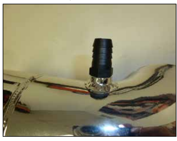
14. Install the provided vent fitting into the K&N intake tube as shown. NOTE: NPT fitting has tapered threads and only designed to be installed until hand tight, then tighten one rotation or when the fittig becomes difficult to return.