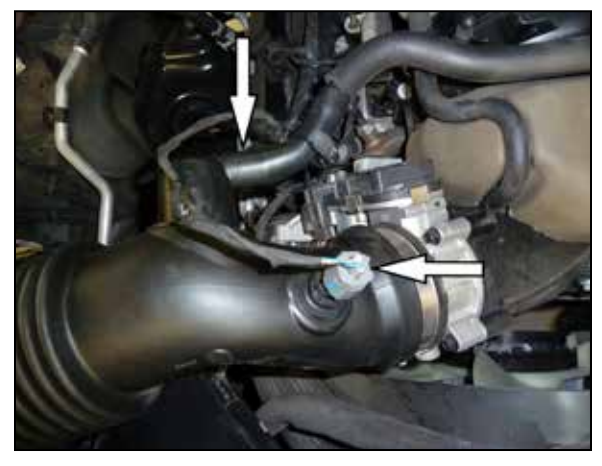
3. Disconnect the IAT sensor electrical connection and unhook the wiring harness from intake tube. Then disconnect the CCV hose from the intake tube.