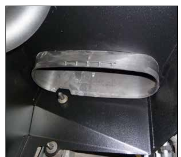
11. Insert the fresh air intake duct into the K&N heat shield.