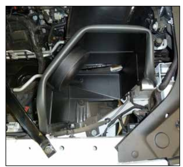
10. Install the K&N heat shield into the vehicle.