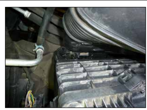
5. Disconnect the fresh air intake duct from the factory air filter housing